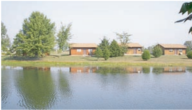
Private Fishing Lake

Cannon Dam Cabins & General Store 42526 Cabin Road, Rt. J Perry, Mo. 63462 573 565-3432 * www.cannondam.com