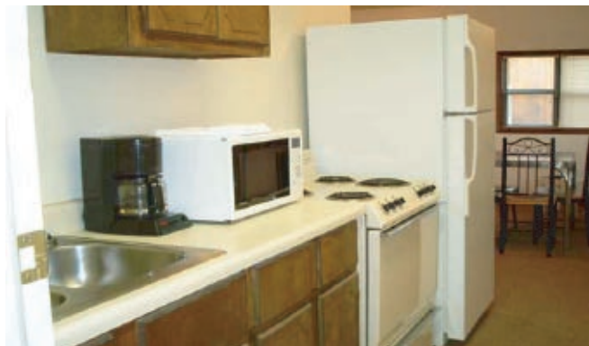
Fully Equipped Kitchens

Cabin Features Air Conditioned Heated Carpeted Satellite TV Sleeps up to 6 adults Linens Provided Full Kitchen Refrigerator Electric Range Coffee Maker Toaster Microwave Utensils Dishes Cooking Pans Towels Dish soap Kitchen table seats 6 BBQ grill & Picnic table Campfire Ring Playgrounds