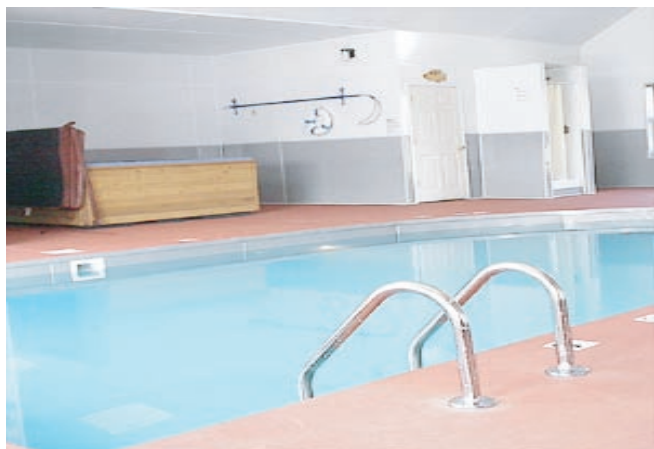
Indoor Pool, Jacuzzi & Sauna