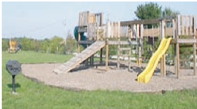
Playgrounds, Pavilions & BBQ Areas